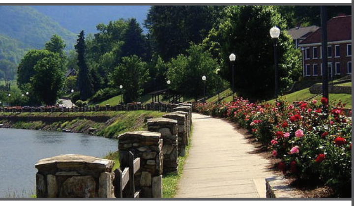
Every walk is FREE and pre-registration is not required.

Walk with a Doc is a unique, physician-led walking program focused on encouraging physical activity among patients. Each walk is hosted by a physician speaking about a health topic of interest.